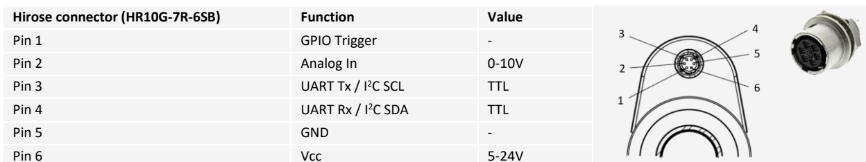
Table 2: Pinout of the DTLP-11-0267-208 with female Hirose connector ("EC1" version with ECC-1C integrated).