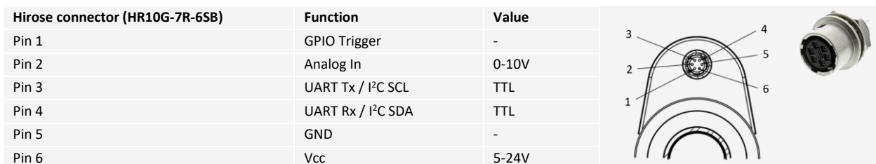
Table 2: Pinout of the DTLP-11-06-160 with female Hirose connector ("EC1" version with ECC-1C integrated).