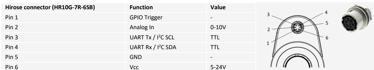
Table 2: Pinout of the DTLP-43F-0267-208 with female Hirose connector ("EC1" version with ECC-1C integrated).