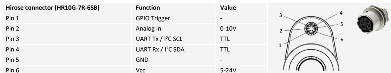
Table 2: Pinout of the DTLP-S-1-0638-70 with female Hirose connector ("EC1" version with ECC-1C integrated).