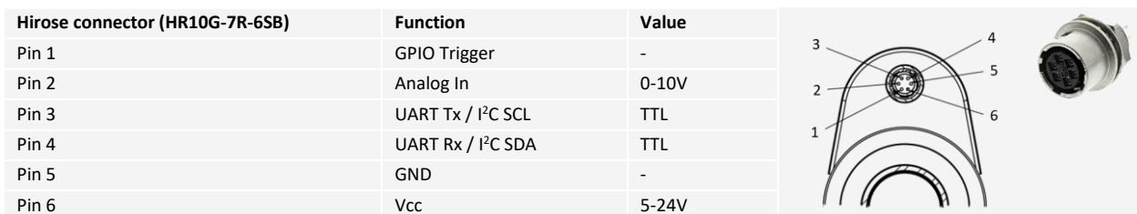
Table 2: Pinout of the TLP-43-056-200 with female Hirose connector ("EC1" version with ECC-1C integrated).